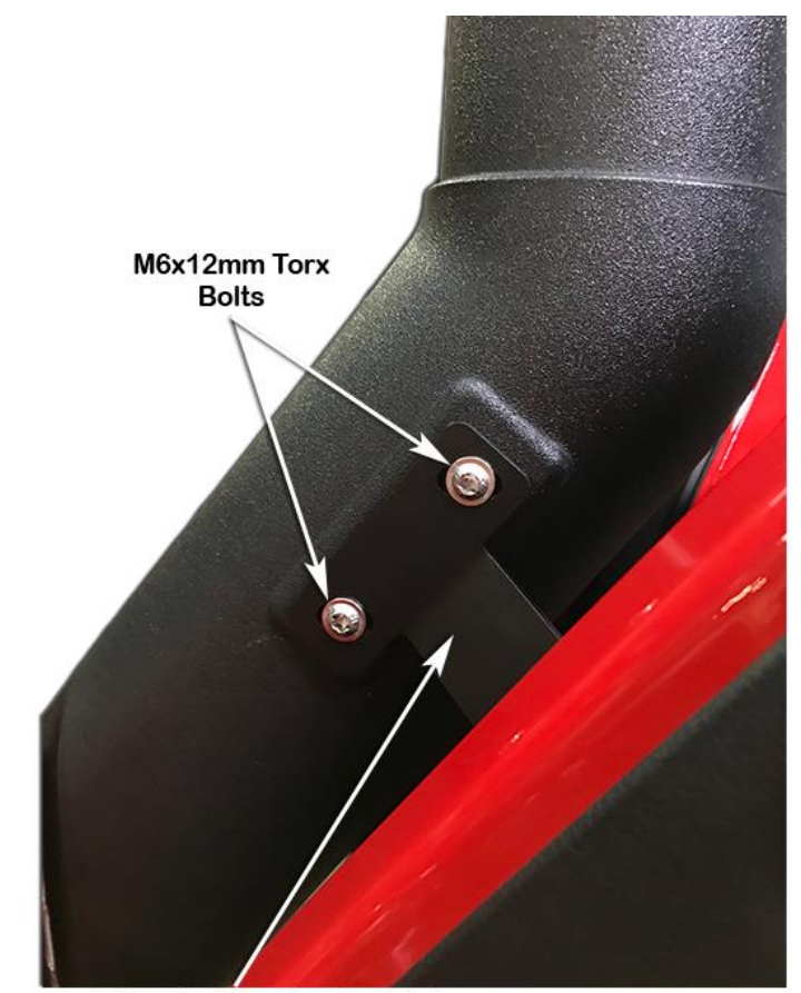
Grab Handle Mounting Bracket

Align the grab handle mounting bracket to the 6mm brass mounting inserts in the snorkel body, loosely install the two M6 x 12mm Torx bolts (item 2).