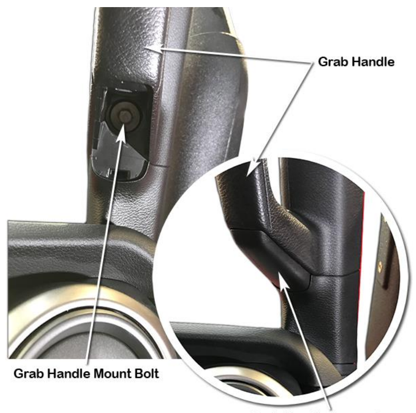
Grab Handle Lower Cover

Remove the lower cover on the right hand side grab handle, using a 10mm socket remove and retain the lower grab handle mounting bolt.